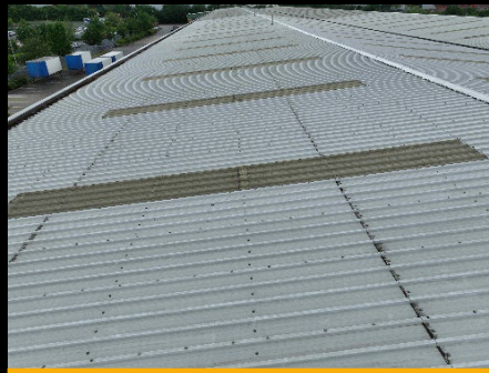
Preparation Sheetting jet washed