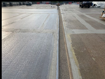
Install of Triflex Deckfloor System