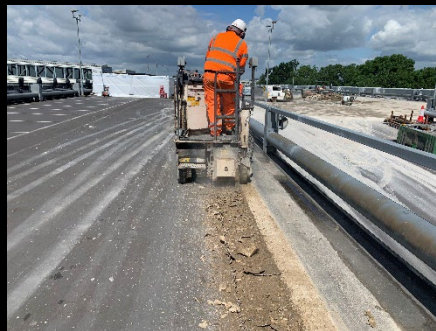
Removal of Coatings