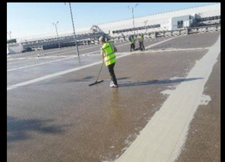
Banding and Priming